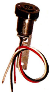
Photo Cell Socket

3000 installs in existing ANSI compliant pole top sockets. The CRD 3000 installs without software tools, using simple, on/off indicator lights to tell installers that reliable RF communications have been established within seconds of installation. As an integral infrastructure device, no changes are required to existing maintenance, management, and visualization software for LonWorks based street lighting networks utilizing the SLB.